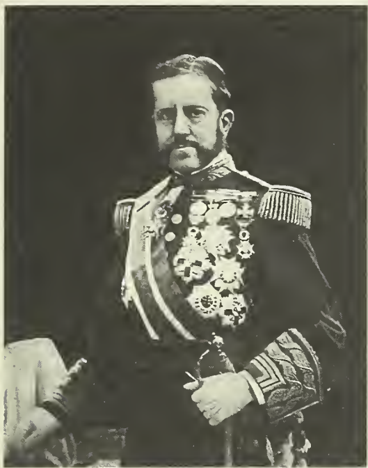
FIGURE 3.3 • General Valeriano Weyler.

Valeriano Weyler. Cubans, and especially the U.S. press, called him “The Butcher.” His policy of reconcentration from 1896—a euphemism for the forced relocation of over 300,000 Cubans to isolated areas to clear the path for counterinsurgency operations—killed somewhere between 150,000 and 170,000 civilians, an estimated 10 percent of the island’s population. 25